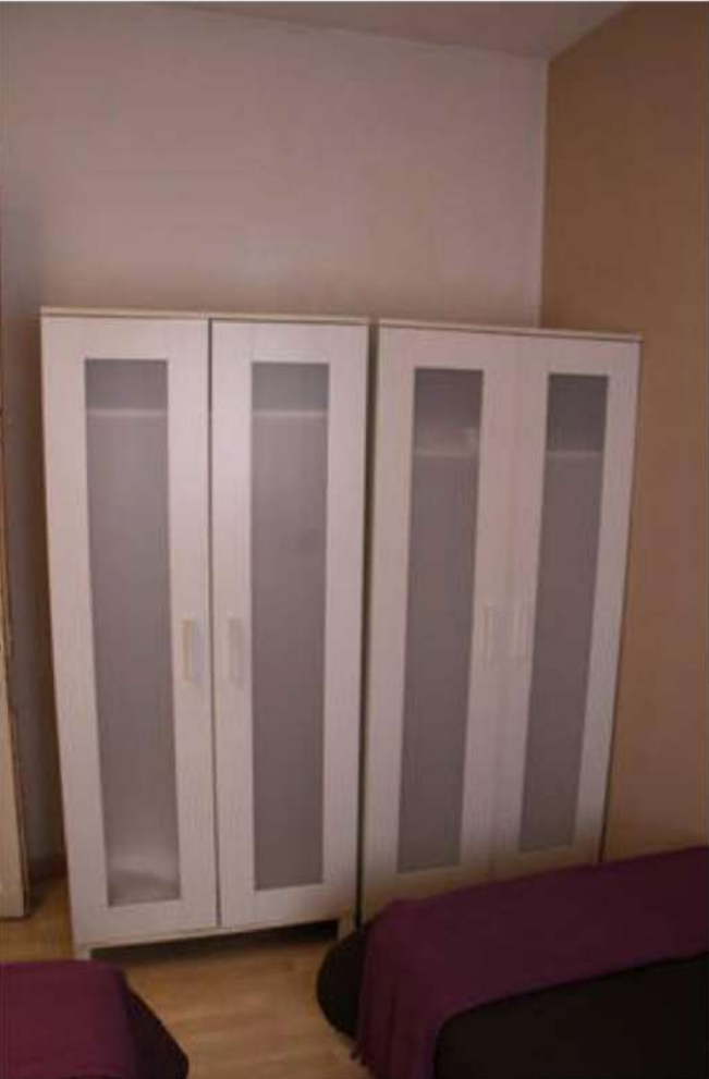
Third bedroom is outfitted with two twin beds and two big wardrobes.